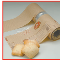
Form, Fill and Seal