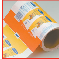
Printed and Plain

www.detmoldindustrial.com packaging@detmoldindustrial.com